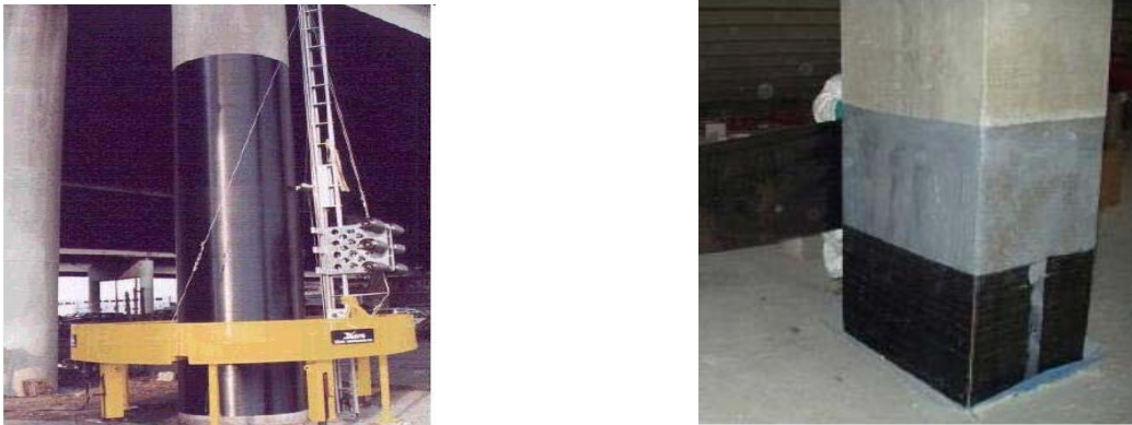
Figure 2. Application of FRP for seismic retrofitting of RC columns

When an earthquake hits, reinforced concrete columns are considered to be the most vulnerable part of a typical RC structure as they are the major load carrying element of the building. Minimum cross section size and lack of steel reinforcement in under designed columns leads to a weak column—strong beam construction. It is very important to strengthen the columns so that the plastic hinges are formed in the beams since it allows more effective energy dissipation. Moreover, columns should be adequately designed to avoid a soft story collapse of a building due to seismic action.